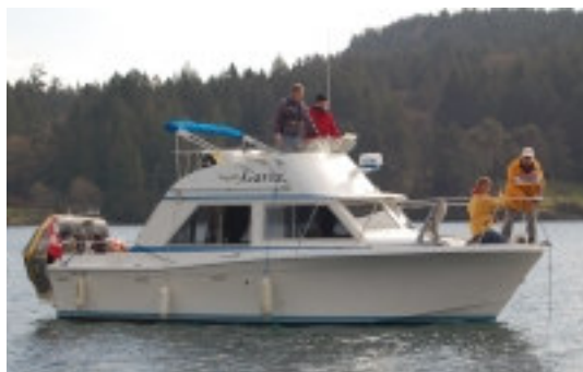
Anchoring demo by Skipper Campbell

The cruise is a great way to meet other squadron members and help the students with an excellent practical exercise. Skippers and proctors are always needed for the cruises; please contact the student cruisemaster if you can help. The next student cruise will be in late October or early November.